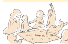
Year 1: Sparking Creativity

The three year project will work through developing staff and students experience with creative writing with Year 1 - Sparking Creativity, Year 2 - Nurturing Creativity and Year 3 - Sustaining Creativity.