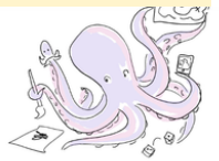
Year 3: Sustaining Creativity